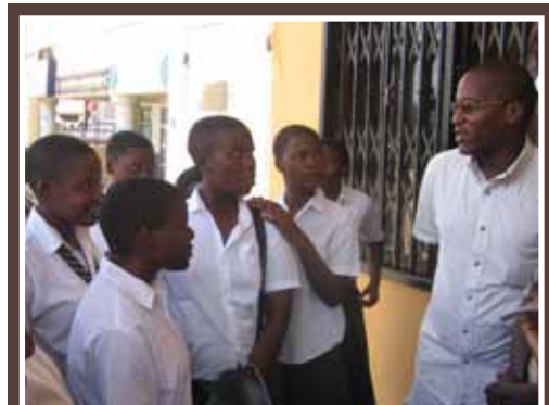
The Commerce and Bookkeeping class put business concepts into action in their local community.