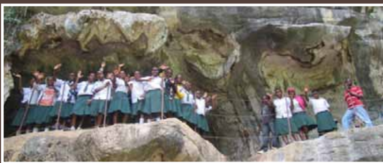
Teachers and students bond over a walking and crawling tour of ancient caves in Tanga