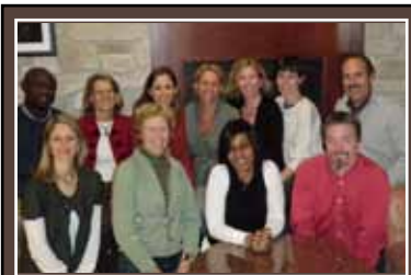
Nurturing Minds Board 2010