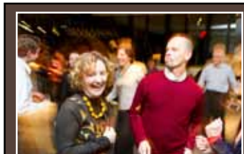
The afro-pop music was a hit at the African Dance Party fundraiser held in Brighton, MA in Jan.

Bryn Mawr Presbyterian Church donated $5,000 towards Segas's Non-Formal Education Day Program and HIV Training.